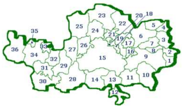
Figure 1 - Mesoregion of Campo das Vertentes

and immaterial heritage in the municipalities.